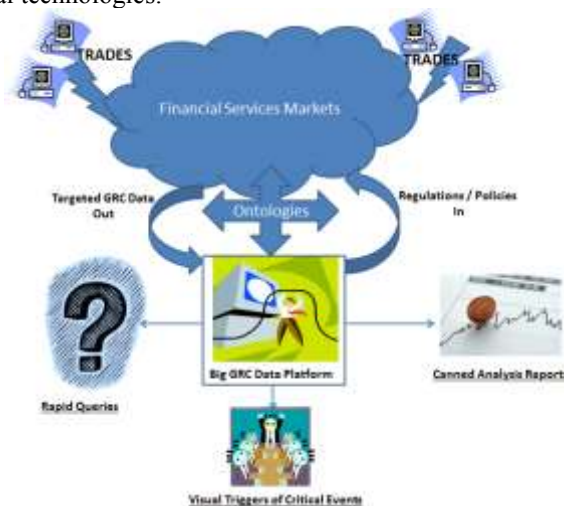
Fig. 1. FIORD High level View

of 2010. [3]. In this later respect we envision providing semantically augmented technology solutions to market participants' infrastructure and regulators' monitoring capabilities which would gain and apply knowledge of the industry and the use of data there-in. This knowledge will be captured in open source versions of ontologies and semantic algorithms, which in turn will be put forth as draft standards for the financial services industry to upgrade and update the technology of this globally important but volatile industry. The core of our research (see Fig. 1) relates to the use of semantic technologies, ontologies and taxonomies. Industry-standard tagging of data are emerging as one of the technologies to enable the financial industry and its regulators to observe financial transactions by computer means through their ability to precisely define data content, facilitate classification, represent data rules and add dimensions of intelligence onto data structures more efficiently and at a lower cost than conventional technologies.